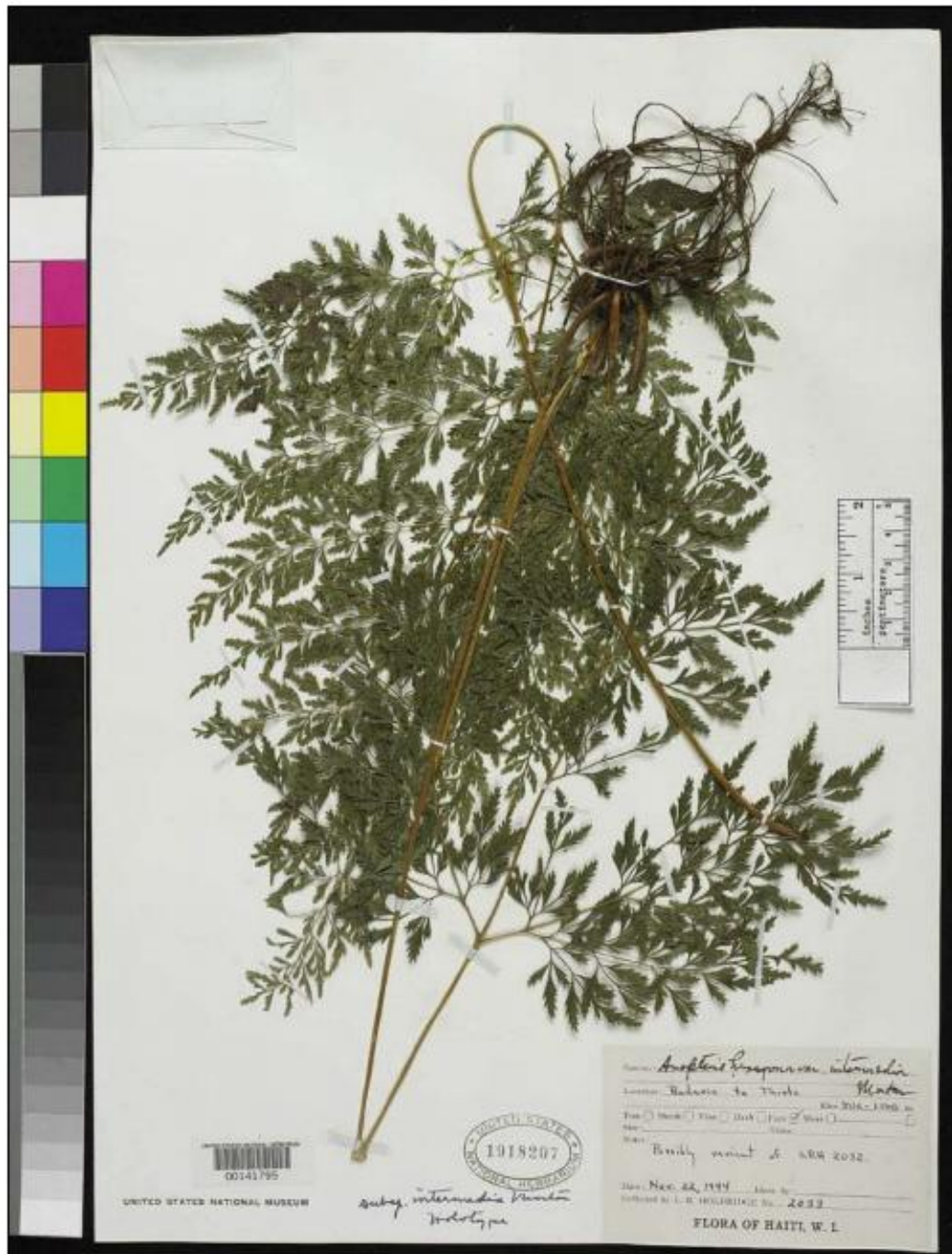
Fig. 3. Holotype of Anopteris intermedia (Morton) A. Vaganov et Shmakov (US)

3. A. intermedia (Morton) A. Vaganov et Shmakov, 2010, Turczaninowia, T. 13 (1): 10. – Anopteris hexagona subsp. intermedia Morton, 1957, Bull. Jard. Bot. Etat 27: 583.