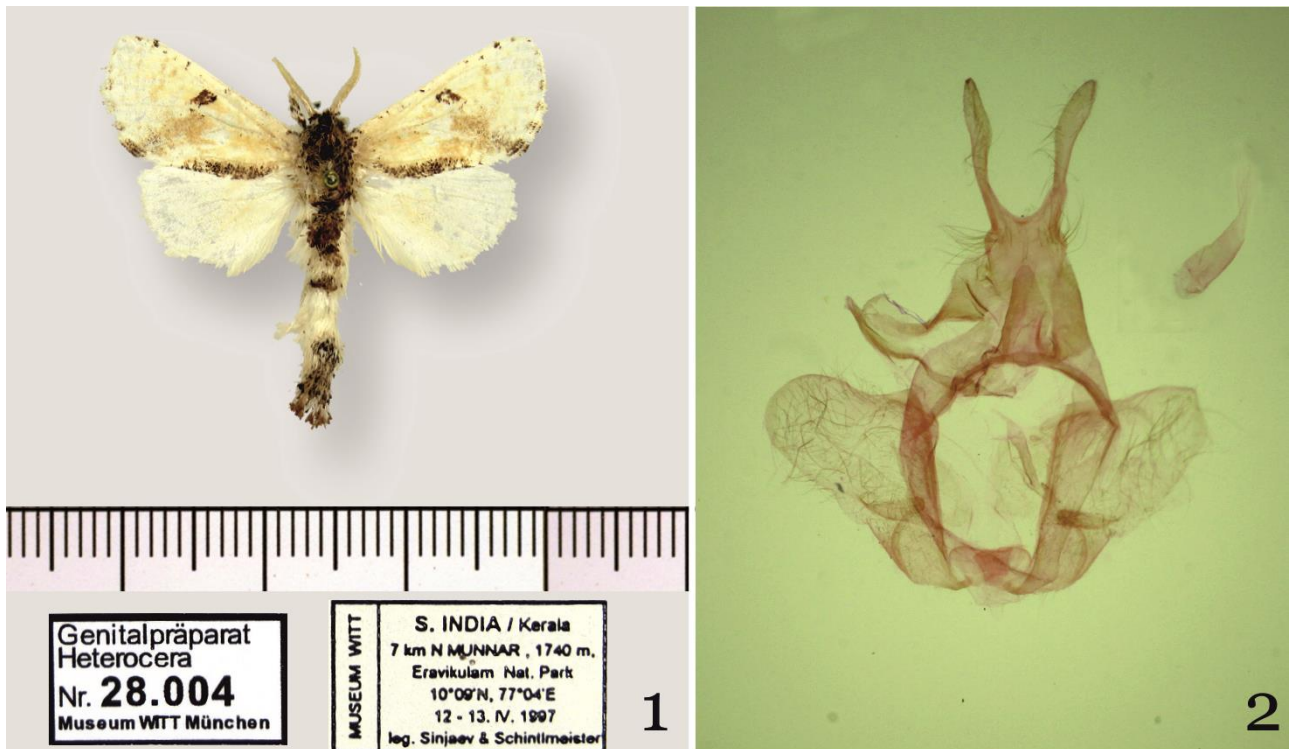
Figures 1–2. Ghatarbela bifidunca sp. nov.: 1. male holotype (MWM); 2. male genitalia (holotype: slide Genitalpräparat Heterocera MWM: 28.031).

Description. Length of fore wing 13–15 mm; antenna yellowish; thorax, abdomen basally and apically covered with long brown scales strongly widened apically, medium third of abdomen covered with light-yellow scales. Fore wing yellowish with bright dark-brown discal spot, not numerous small dark-brown to blackish dots along costal edge, narrow dark-brown stroke along anal edge, poorly expressed blurred light-brown portions discally and postdiscally, cilia chess mottled (yellowish between veins, brown at veins).