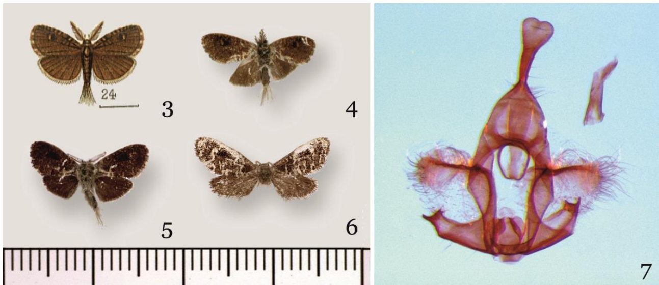
Figures 3–7. Micrarbela minima (Hampson, 1910): 3. reproduction from the original drawing; 4. male holotype (NHMUK); 5. male, Ceylon, Mankulam (NHMUK); 6. female, Ceylon, Mankulam (NHMUK); 7. male genitalia (slide NHMUK: 010315535).